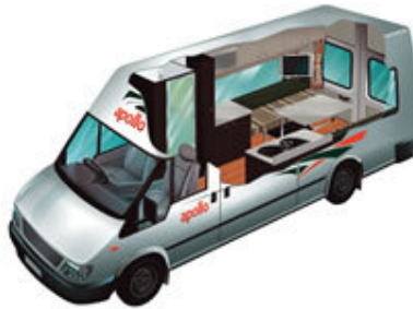
Euro Tourer Cutaway Diagram