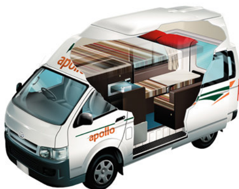
Hitop Cutaway Diagram

Quality fixtures and fittings such as a fridge, gas stove and sink mean cooking in your Hitop is a breeze. In the evenings, bunk down in the spacious double bed and additional overhead bed.