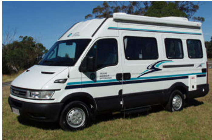
The 3 Berth Cruiser Campervan .

This vehicle is a large, spacious campervan and offers all the features of the larger models.