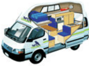
Day Time Layout